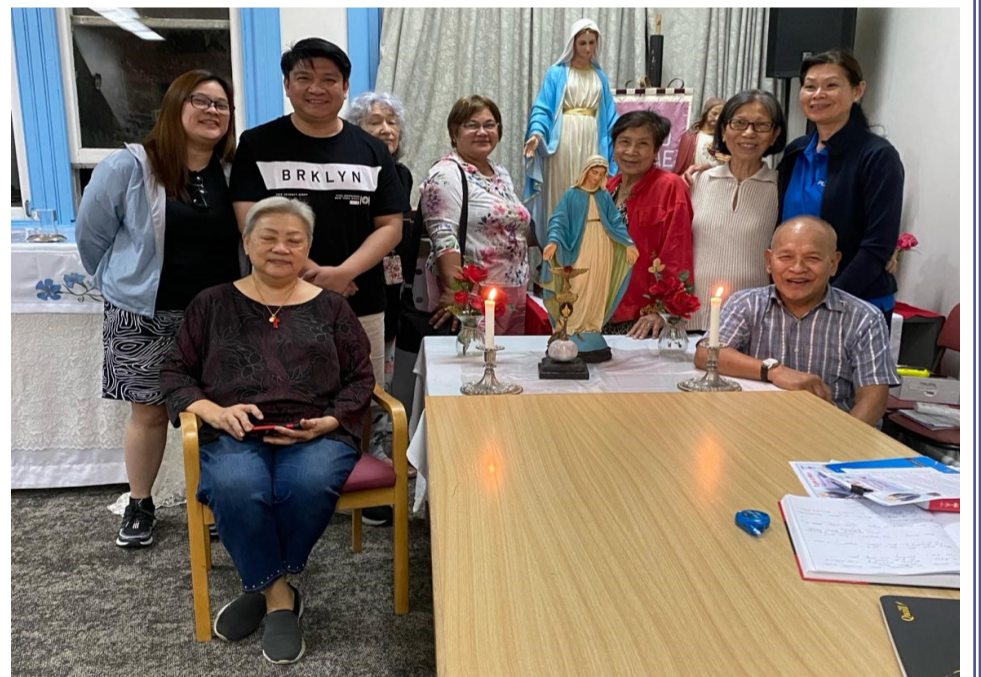
New Praesidium—Mother Mary of God at Paroquia Atauro - Dili Tomor Leste