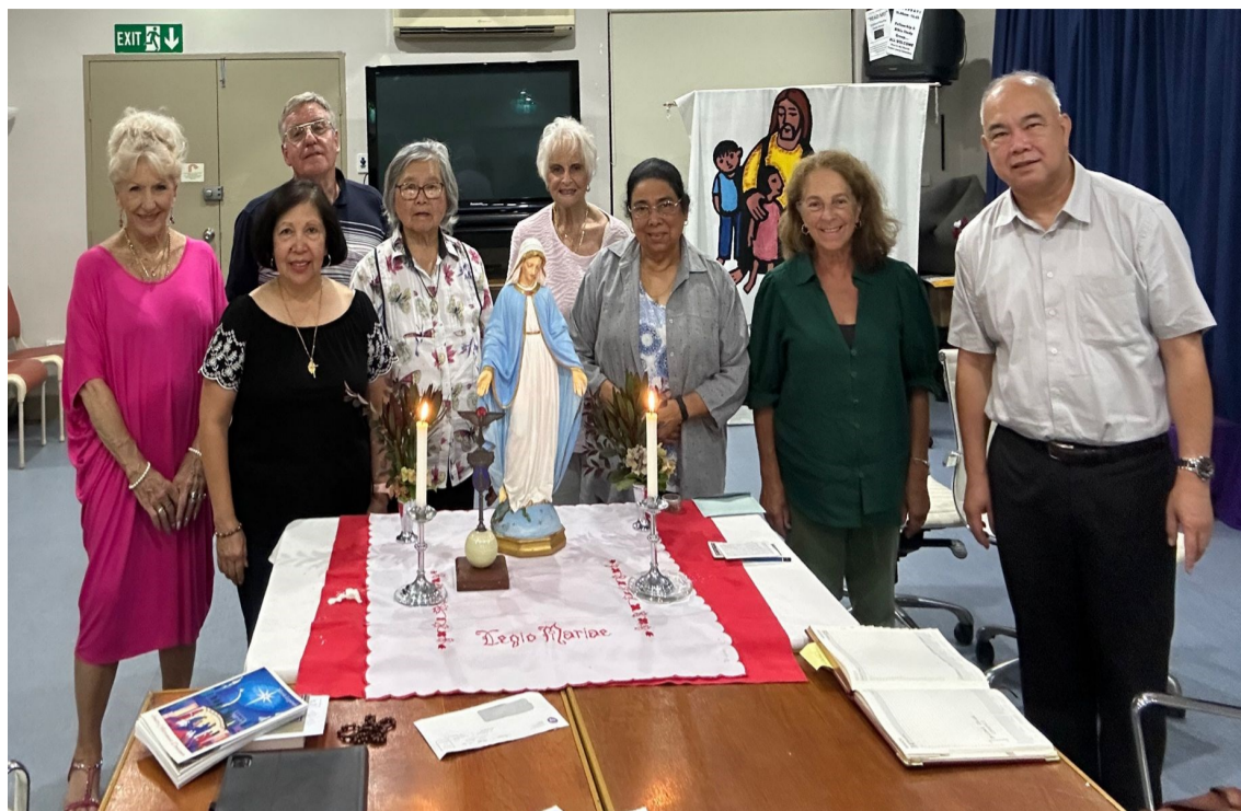
“Thanks you so much for your assistance in the recruitment process at St Pius V Catholic Church Enmore on March 2024 ! We truly appreciate it “