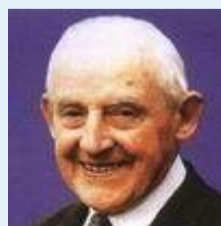
The Servant of God Frank Duff