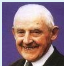
The Servant of God Frank Duff