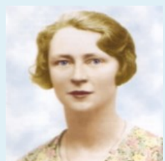
Venerable Edel Quinn