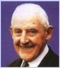
The Servant of God Frank Duff