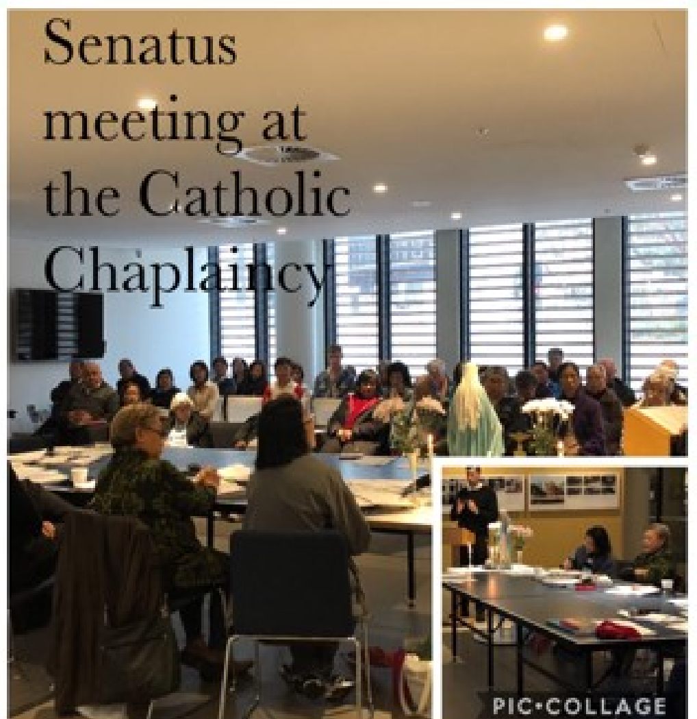
Senatus meeting at the Catholic Chaplaincy