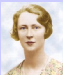
Venerable Edel Quinn