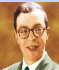
The Servant of God Alfie Lambe