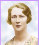
Venerable Edel Quinn