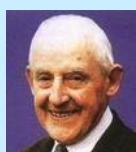
The Servant of God Frank Duff