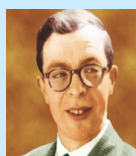
The Servant of God Alfie Lambe