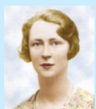
Venerable Edel Quinn